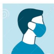
WEAR A FACE MASK

In order to take the needed safety measures during the COVID-19 pandemic, each student wishing to participate must pre-register by e-mail to the department: microbiology@ff.mu-plovdiv.bg to coordinate and save the selected date and time from the schedule. To be allowed in the drawing room, the student must be wearing a protective mask, gloves and keeping safe distance of 1.5 m.