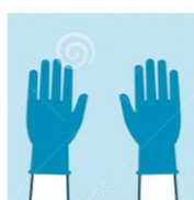
WEAR DISPOSABLE GLOVES