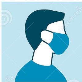
WEAR A FACE MASK

In order to take the needed safety measures during the COVID-19 pandemic, each student wishing to participate must pre-register by e-mail to the department: microbiology@ff.mu-plovdiv.bg to coordinate and save the selected date and time from the schedule. To be allowed in the drawing room, the student must be wearing a protective mask, gloves and keeping safe distance of 1.5 m.