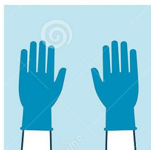
WEAR DISPOSABLE GLOVES