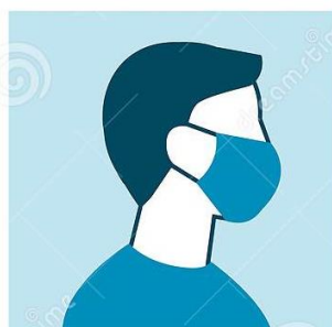
WEAR A FACE MASK

All students must come wearing a protective mask, gloves and keeping safe distance of 1.5 m.